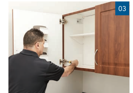
03 Final walk-through and adjustments ensure a fully functional space