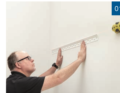
01 Field measurements confirmed to ensure seamless installation