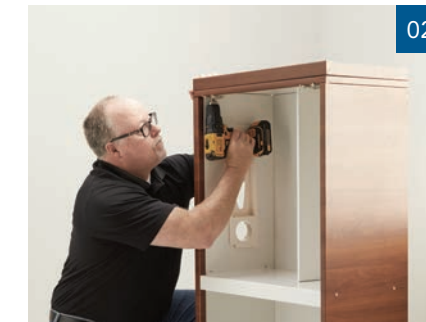
02 Expert product assembly so you get the most out of your cabinetry