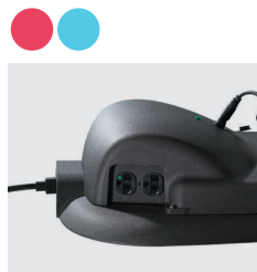
Optional Electrical Outlets on the Chair