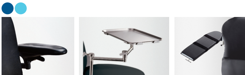
Accessories for an Optimized Workspace