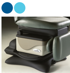
Flexible Positioning with Rotation Base

Narrow Footprint for Easy Access to the Patient