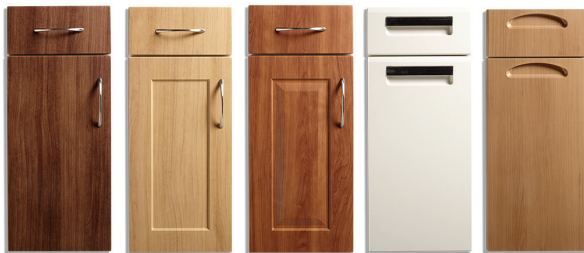
Panels: Serenity, Transcend, Pinnacle, Renew and Cove

Providing innovative design for the dental environment, complete with modern finishes, Synthesis Cabinetry offers a blend of functionality with sophistication.