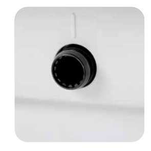
Accessory Receivers Standard receivers allow for the integration of accessories without the use of tools.