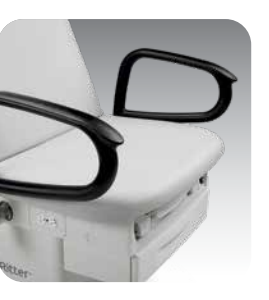
Assist Arms Provide patients with a stable gripping surface for entering, exiting or repositioning on the exam chair.