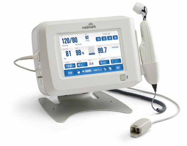
Midmark Digital Vital Signs Device shown with Exergen® TemporalScanner® thermometer and optional Masimo® SpO<sub>2</sub>.

Using a Ritter® Barrier-Free exam chair with an automated vital signs device like the Midmark® Digital Vital Signs Device allows you to automate vital signs capture at the point of care, saving time and reducing transcription errors. Once vital signs data is captured, it can be imported directly into the EMR.