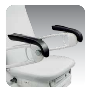
Patient Support Rails+ Help achieve proper positioning of the patient's arm for blood pressure capture.