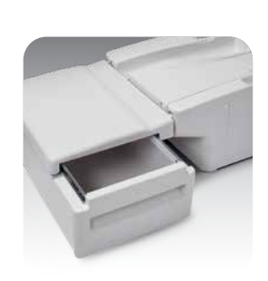
Supply Assistant Provides extra storage for bulky exam supplies. Keeps drapes, gowns and similar items within easy reach.