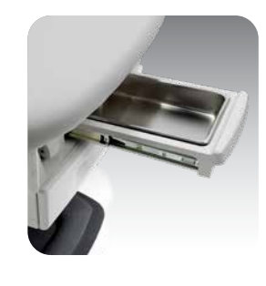
Stainless Steel Debris Tray Ideal for lower-body procedures or other situations in which removal of fluid and debris is necessary.