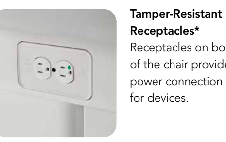
Receptacles* Receptacles on both sides of the chair provide a power connection for devices.