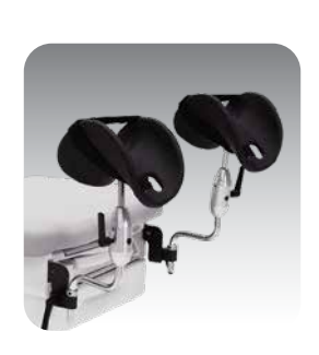
Articulating Knee Crutches The unique ball-socket design allows for a maximum range of adjustment, designed to ensure optimum knee and leg support.