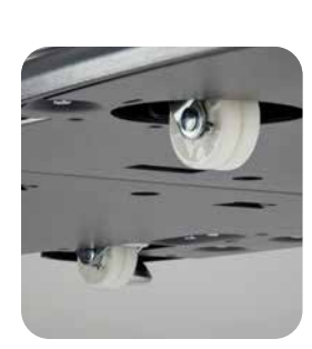
Clean Assist Roller System The retractable roller base allows you to safely move the chair for cleaning.