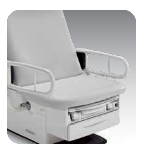
Patient Support Rails Provide patients with a 1¼ inch diameter continuous gripping surface for entering, exiting or repositioning on the exam chair.