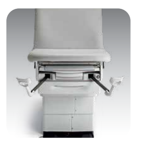
Stirrups + Pelvic Tilt* Help position patients properly and comfortably for lower-body examinations.