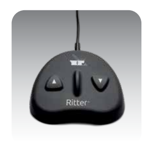
Foot Control Standard foot control designed to make patient positioning quick, effective and always within reach.