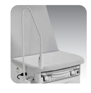
Ritter® 253 LED Exam Light Designed with easy access controls, high-intensity light and an adjustable focal spot. Available in chair mount, wall mount and mobile options.