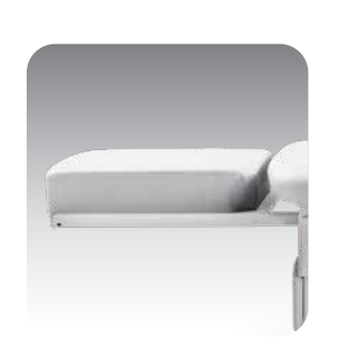
Thick Footrest Pad Enhance patient comfort during medical examinations with the thick footrest pad accessory.

8 224 + 225 Barrier-Free Examination Chairs