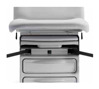
PELVIC TILT + DRAWER WARMER Improve patient positioning and keep your supplies warm during exams, especially in the OB/GYN space. (Optional features)