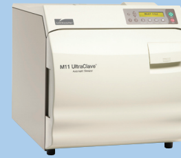
Midmark M11 UltraClave® Automatic Sterilizer