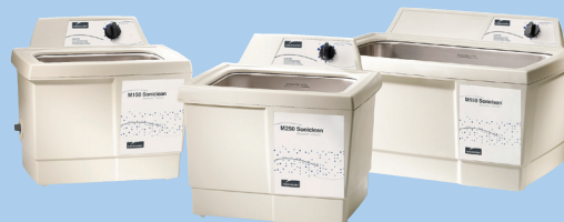
Midmark Soniclean® Ultrasonic Cleaners

This workflow chart is designed to be used in accordance with general state board guidelines. If discrepancies are found, you must, in all cases, follow your local state dental board requirements.