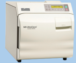
Midmark M9 UltraClave® Automatic Sterilizer