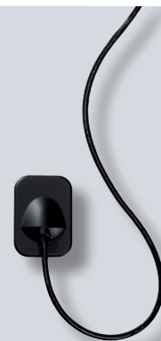
VetPro® OptiMax Digital Sensor The world's first veterinary-specific sensor combines optimal clarity with maximum durability. OptiMax has a patented bite-resistant housing, is hermetically sealed (waterproof), and carries the strongest warranty on the market. It's also the most stable, intuitive and easy-to-use system on the market, designed specifically for veterinary use. Just select a tooth and take the shot.