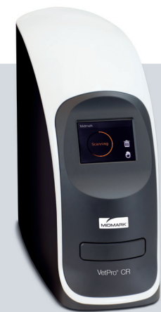
VetPro® CR Radiography Reader Capture images on thin, flexible phosphor imaging plates using your existing X-ray equipment and techniques.

Vetpro® 1000 (Shown with optional venturi suction. This accessory easily retrofits to any Vetpro® 1000 to expand the capabilities of your practice with your existing unit.)