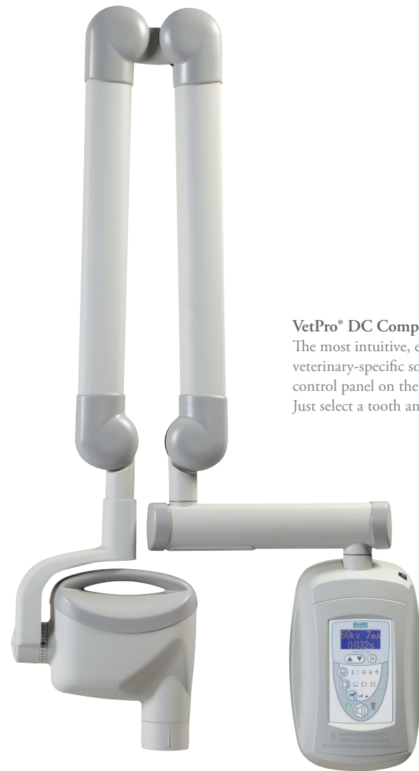
VetPro® DC Complete Systems —The most intuitive, easy to use, veterinary-specific software and control panel on the market. Just select a tooth and take the shot.

Whether your clinic is equipped with film, fully digital or a combination of both, we feel you should have the freedom to choose what you are most comfortable using without sacrificing the quality, service and support that you've come to expect from the Midmark brand. That's why we provide you with multiple imaging options and the training and support you need to get the best use of your equipment.