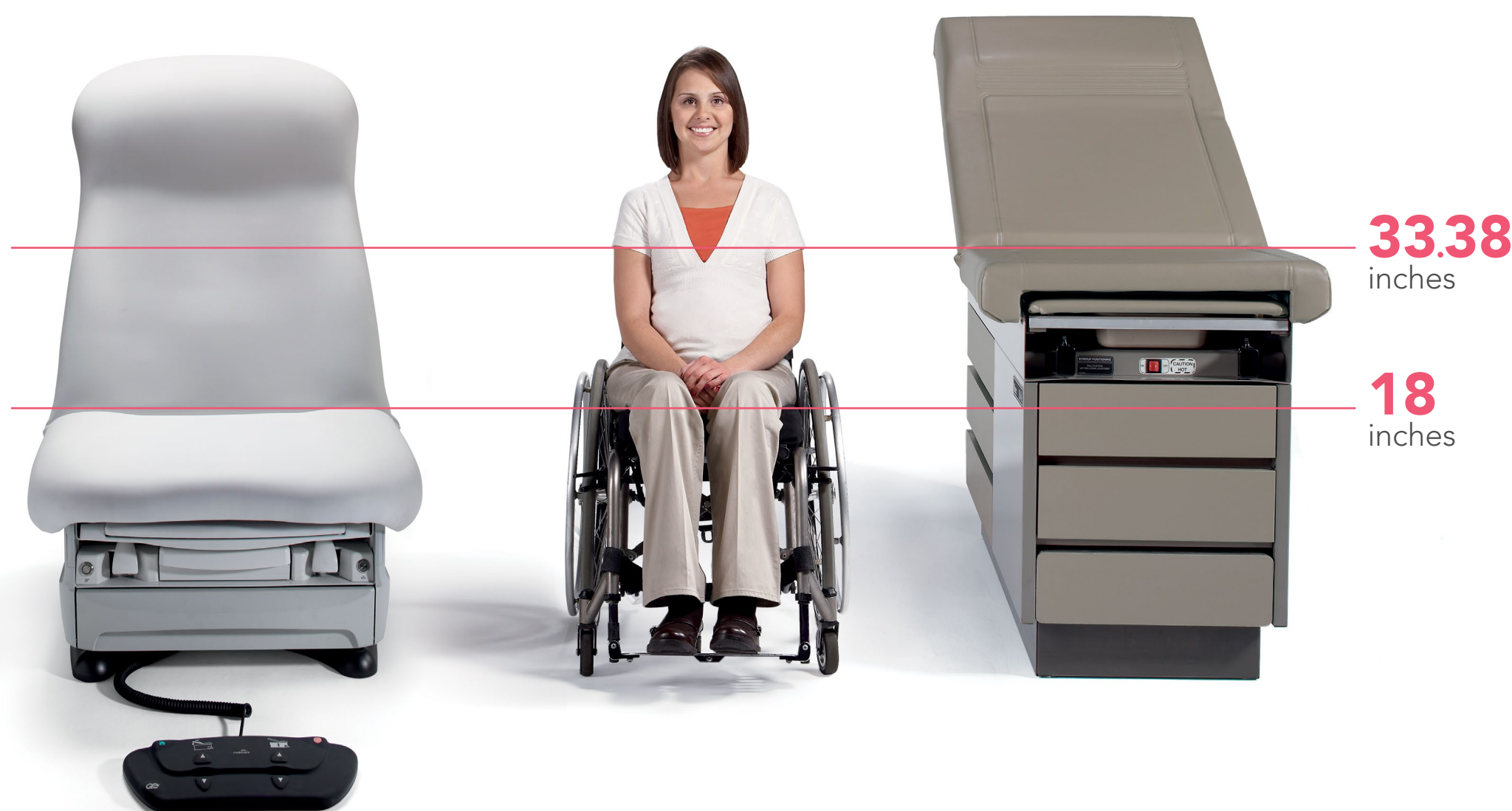
Traditional fixed-height exam table (similar to those found in many clinics)

Two tasks evaluated: 1. assist patient onto a fixed-height table 2. assist patient onto a height-adjustable chair 235 pounds: lift-weight of a patient volunteer with limited mobility