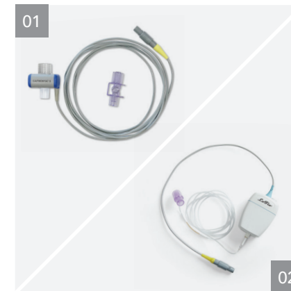
01 Capnostat® Mainstream CO 2 Probe 02 LoFlo™ Sidestream CO 2 Module