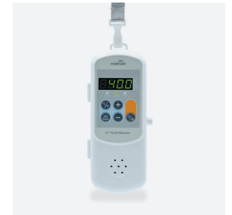
Midmark IV Fluid Warmer