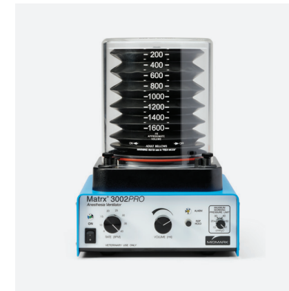
3002PRO Small Animal Anesthesia Ventilator