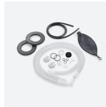
Anesthesia Machine Maintenance Kits