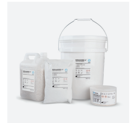
Sodasorb® LF and Sodasorb® CO 2 Absorbent