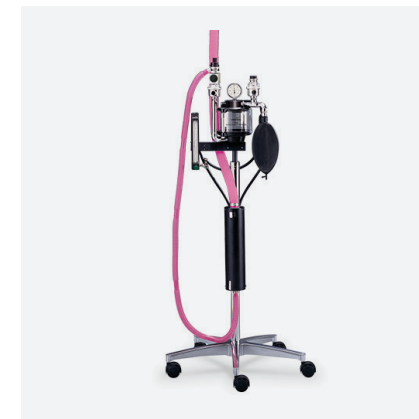
Anesthetic Gas Scavenger