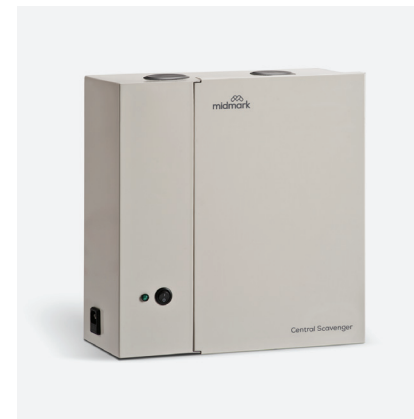
Midmark Central Scavenger