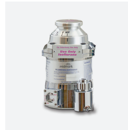
VIP 3000® Vaporizers