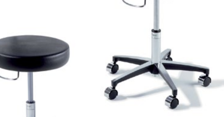
Midmark 277 Air Lift Stool