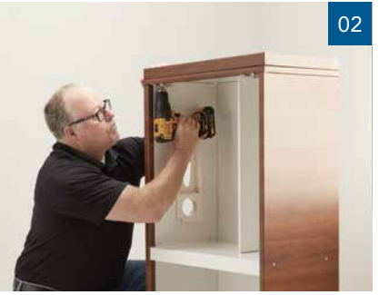
02 Expert product assembly so you get the most out of your cabinetry