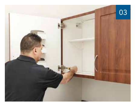
03 Final walk-through and adjustments ensure a fully functional space