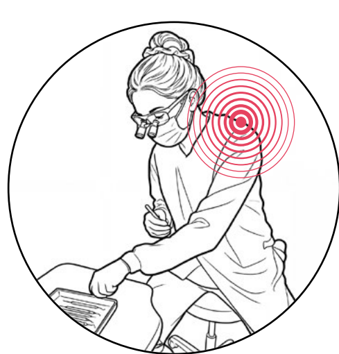
One Extra Twist