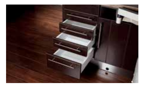
Drawer Systems: Soft-close, full extension Blum® TANDEMBOX™ intivo™ drawers (Silk White); full extension steel ball bearing slides, 100 lb capacity; 5/8″ THK 42-46# mediumdensity particle board core with thermally fused melamine coating (white) bottom and back