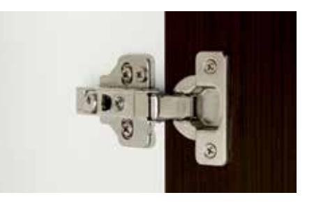
Hinges: Soft-close, concealed European style 110° opening angle, inset, half and full overlay options