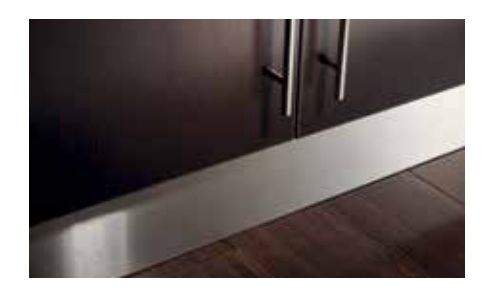
Base: Seamless 16-gauge 304 stainless steel with Camar<sup>®</sup> leg cups and adjustable leveling feet