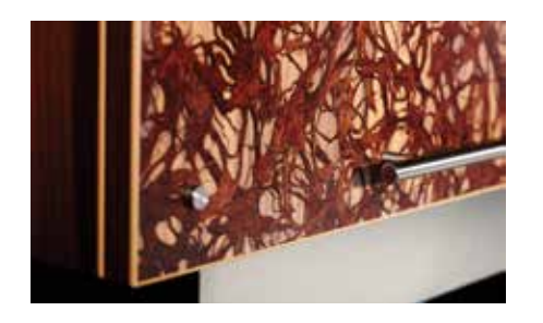
Resin Panels: 1/8" THK Lumicor<sup>®</sup> Lumiform<sup>™</sup> (PETG) ecoshield and Lumishield EX<sup>™</sup> (PC) resin with a satin finish