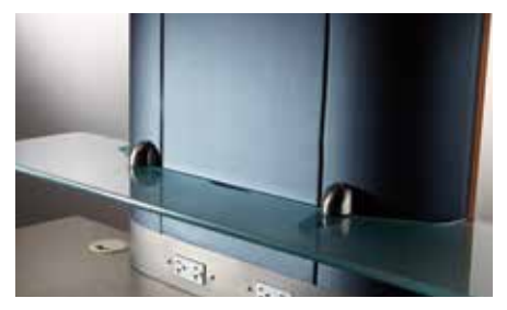
Upholstered Panels: Ultrafabrics® Ultraleather upholstery material

Camar is a registered trademark owned by Camar S.p.A. Ultraleather and Ultrafabrics are registered trademarks owned by Ultrafabrics, LLC. Lumicor is a registered trademark owned by Lumicor, Inc. Blum, TANDEMBOX and intivo are trademarks owned by Julius Blum GmbH.