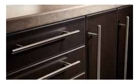
Pulls: Steel, brushed/satin nickel finish