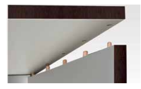
Structure: 3/4" THK 42-46# medium density particle board core with thermally fused melamine coating (white); glued wood dowel frameless construction