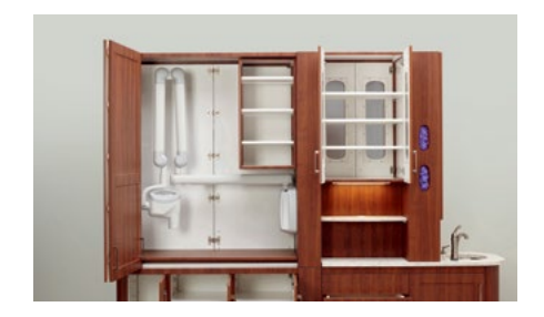
Structure: Powder-coated, 18-gauge cold rolled steel; multi-piece shell and frame design; riveted