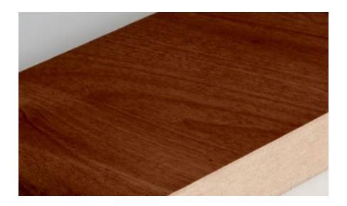
Door and drawer core: 45-lb LEED<sup>®</sup> IEQ-compliant MDF board, 3/4" thick (all composite wood material to meet CARB P2 emission standard of CARB regulation 91320.4)