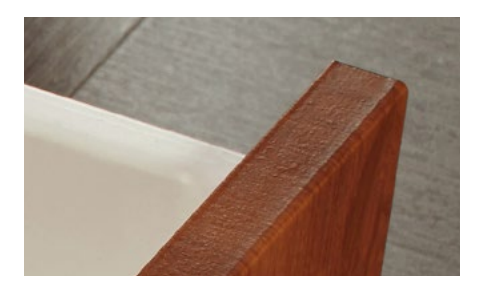
Door and drawer front/back: 12-mm seamless polymer-covered front; melamine back (Frost color)