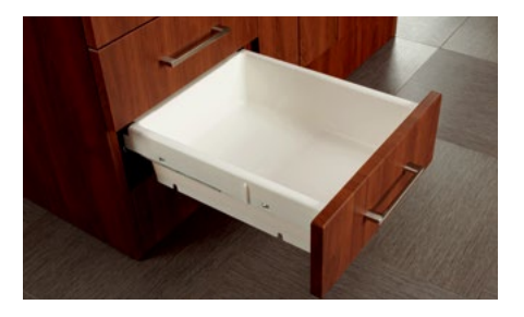
Deep-drawer construction: One-piece, molded polystyrene drawer bodies with rounded corners

Pulls: 128-mm pull offerings (Serenity, Transcend and Pinnacle style); integrated front-pull design (Cove style); recessed clear snap-on pull with interchangeable color strips (Renew style)