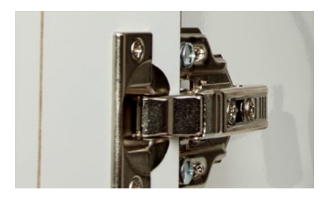
Hinges: Manufacturer's standard Blum<sup>®</sup> hinges; concealed, soft-close, 110° opening, nickel-plated metal, clip-on mount, three adjustment points