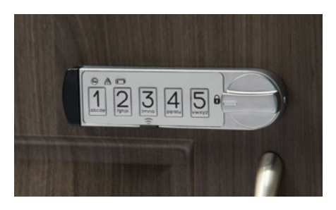
Locks: Lockless, keyed or keyless lock options