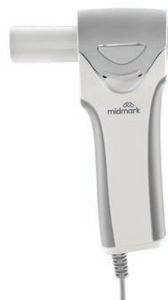
MIDMARK® DIGITAL SPIROMETER