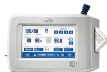
MIDMARK® DIGITAL VITAL SIGNS DEVICE