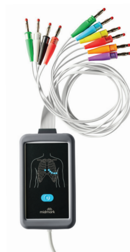
MIDMARK® DIGITAL ECG