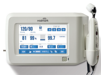
MIDMARK® DIGITAL VITAL SIGNS DEVICE