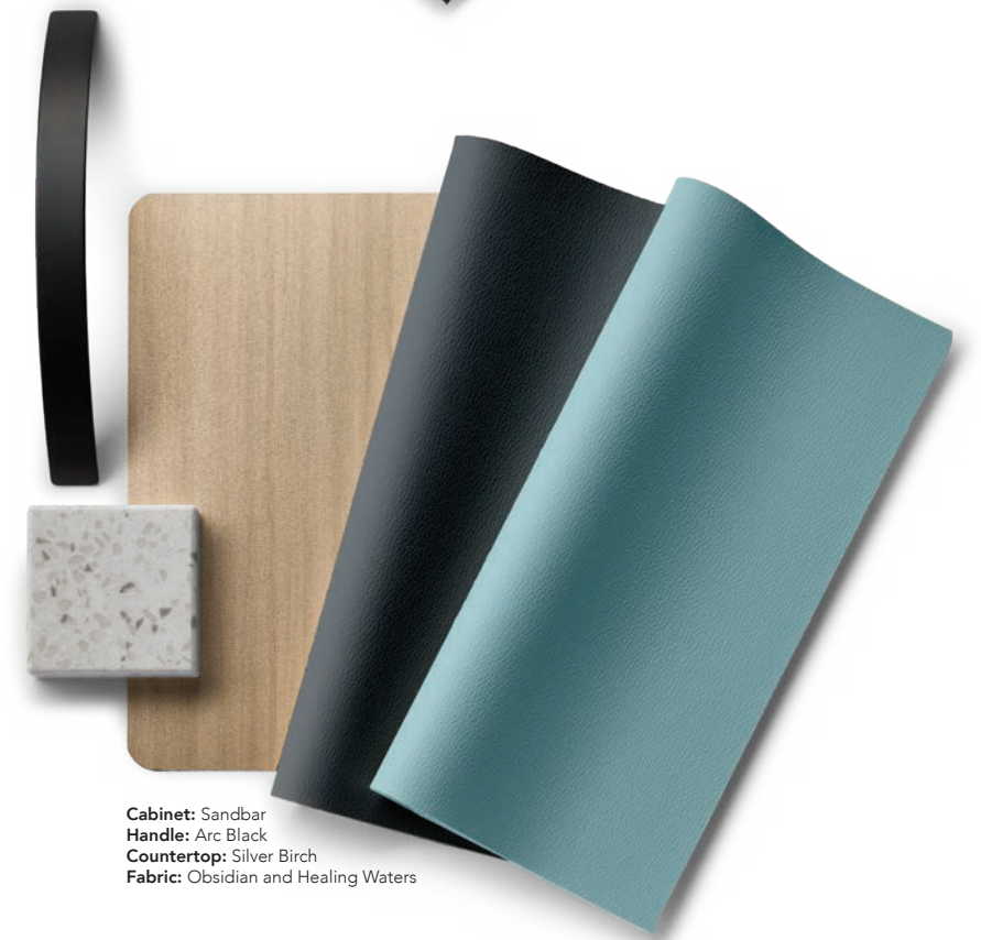
Cabinet: Sandbar Handle: Arc Black Countertop: Silver Birch Fabric: Obsidian and Healing Waters