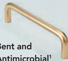
Bent and Antimicrobial 1