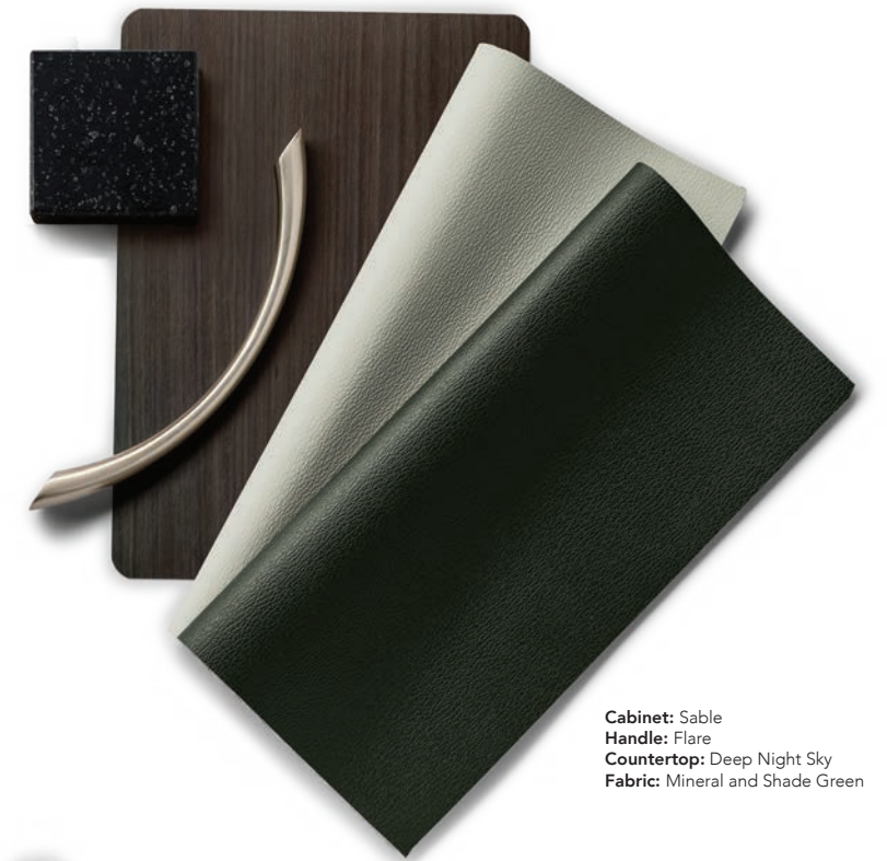
Cabinet: Sable Handle: Flare Countertop: Deep Night Sky Fabric: Mineral and Shade Green

You've explored colors, finishes and design possibilities that elevate your vision . Now it's time to bring it all together. Whether you're updating a single space or planning something bigger, trust your instincts—and know we're here to help every step of the way.