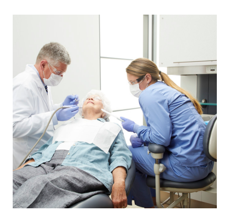
92% of dental clinicians reported MSD symptoms in at least one anatomical region within one year, and dental hygienists were the group most affected.<sup>5</sup>

Dental clinicians must examine the way the operatory functions and how everyone and everything is positioned within it. How much they are sitting throughout the day is also part of that positioning puzzle. A study referenced by Virginia Commonwealth University (VCU) found a significant correlation between length of time spent sitting and severity of low back pain among dentists. Keeping the body in a neutral position as much as possible, along with regular breaks for standing and walking are critical ergonomic considerations to prevent the compounding issues that lead to lifelong MSD symptoms.