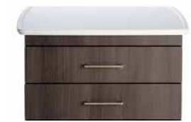
Kydex® Contour Top

Pulls Choose from a variety of pulls including integrated, recessed and EPA-registered, antimicrobial options. EPA registration number 85353-2