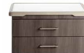
Soft Edge Bumper Top