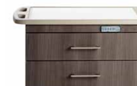
Soft Edge Handle Top

Security Keyed and digital keyless lock options are available for additional security.