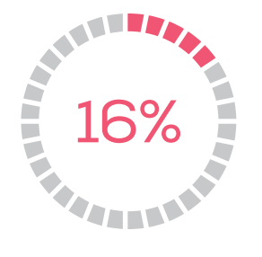
Percentage of patients affected by a difference of 5 mmHg, either causing them to be placed on medication or have a missed diagnosis of hypertension.<sup>6</sup>