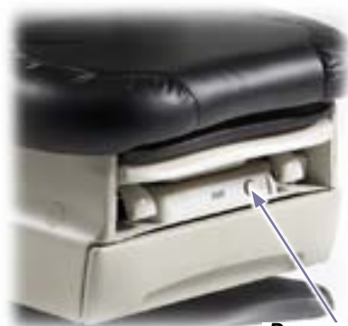
Drawer Heater Switch

Pull drawer front upward until it snaps back into the horizontal position.