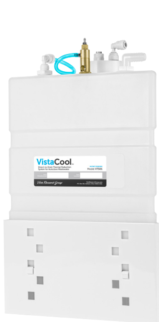
S7545 - Single Tank Stand with adjustable straps