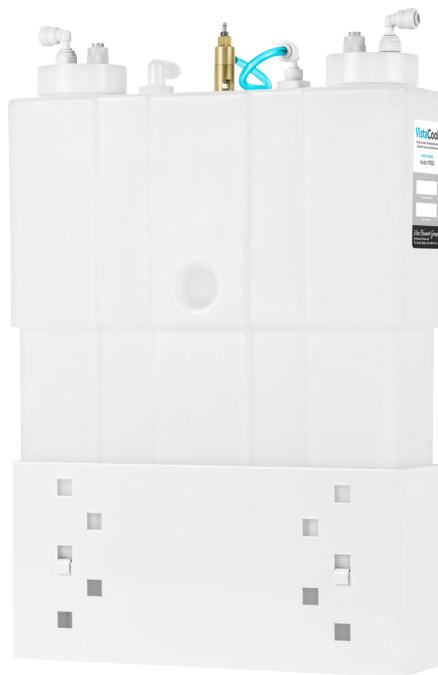
S7547 - Double Tank Stand with adjustable straps